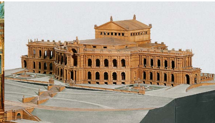
Model for a Richard Wagner Festival Theatre, planned 1864–1866, King Ludwig II Museum

theatre/stage designs record this aspect of his life. The royal residences of Neuschwanstein Castle, Linderhof Palace and Herrenchiemsee Palace as well as Ludwig II's other building projects are also covered. Highlights of the museum include the magnificent furniture that originally stood in the royal apartment in the Munich Residence (destroyed during the Second World War) and the first state bedroom in Linderhof Palace. Elaborately handcrafted items, show-pieces that were commissioned by the king, document the European standing of Munich art in the second half of the nineteenth century.