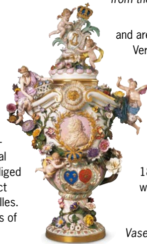
Vase with relief bust of King Louis XIV of France

King Ludwig II's original idea was to have a copy of Versailles Palace built on the Herreninsel as a 'Temple of Fame' in honour of the Sun King Louis XIV of France. Started in 1878, it was thus intended purely as a monument to absolute monarchy and had no practical function. The architect Georg Dollmann was obliged to study the original model and even reconstruct rooms which had long ceased to exist in Versailles. The main rooms are some of the best examples of nineteenth-century interior design in existence,