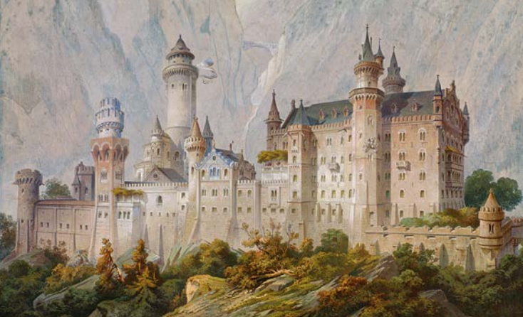
An idealised design (not executed) for Neuschwanstein Castle, painted in 1869 by the theatre-set designer Christian Jank, King Ludwig II Museum (WAF München)

theatre/stage designs record this aspect of his life. The royal residences of Neuschwanstein Castle, Linderhof Palace and Herrenchiemsee Palace as well as Ludwig II's other building projects are also covered. Highlights of the museum include the magnificent furniture that originally stood in the royal apartment in the Munich Residence (destroyed during the Second World War) and the first state bedroom in Linderhof Palace. Elaborately handcrafted items, show-pieces that were commissioned by the king, document the European standing of Munich art in the second half of the nineteenth century.