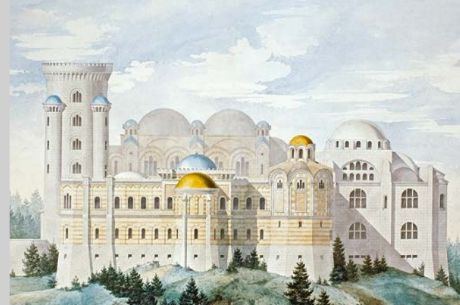
Design for a Byzantine palace, Julius Hofmann, 1885; diary of King Ludwig II with a temple of the Holy Grail (centre), both in the King Ludwig II Museum