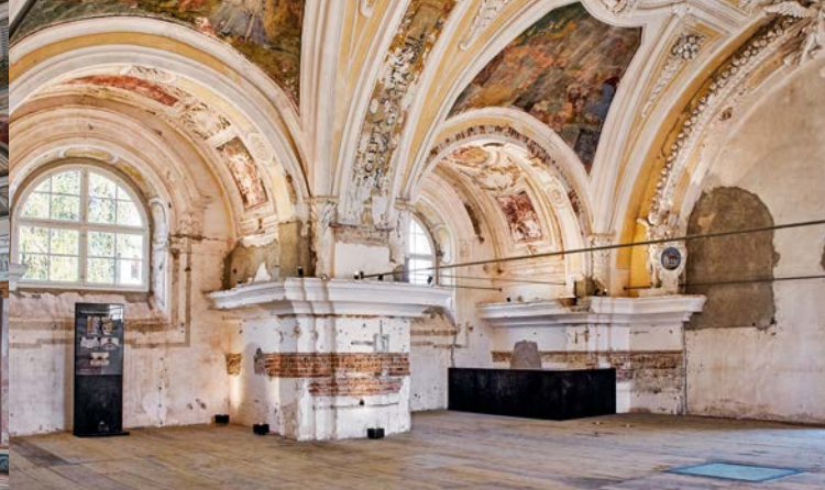
View of the so-called Island Cathedral after the Baroque pilaster church was converted into a brewery with a malthouse and mashhouse