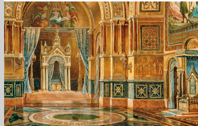
Painting of the bedchamber in the proposed Falkenstein Castle, Max Schultze, 1885, King Ludwig II Museum

The museum is housed in twelve modernized rooms on the ground floor of the south wing and was opened in 1987. It documents the story of Ludwig II's life, from his birth to his tragic early death, with painted portraits, busts, historic photographs and original state robes. The king also has a place in the history of music as the patron of the composer Richard Wagner. Portraits, written documents and