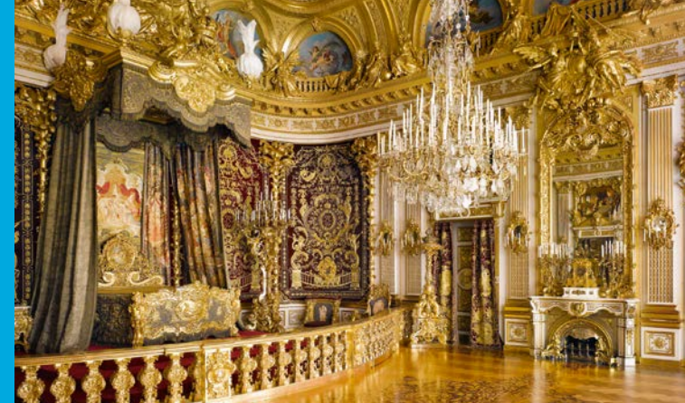
The State Bedchamber in the State Apartment, in the style of Louis XIV of France, is the most expensively appointed room from the 19th century. It was created between 1879 and 1881