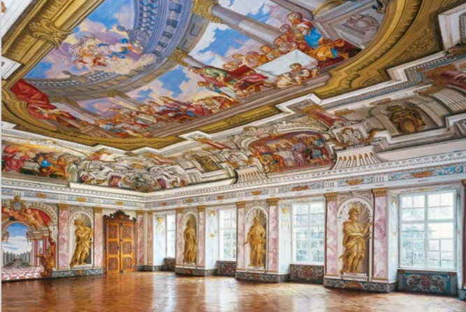
The Imperial Hall served as a festival and dining hall. The illusionistic wall and ceiling painting is by Benedikt Albrecht (1715).