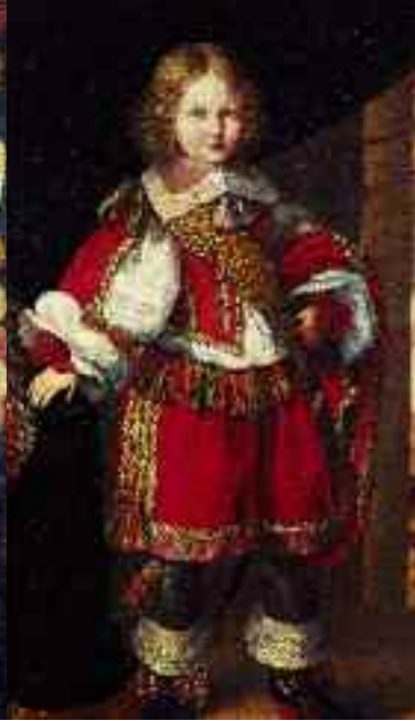
Margrave Christian Ernst, 1657 (left); Hans von Kulmbach, rosary picture, c. 1516/18 (middle)