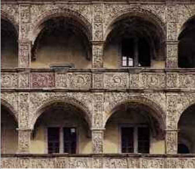
The arcades in the »Schöner Hof« are decorated with reliefs which also include idealized portraits of the Hohenzollerns.