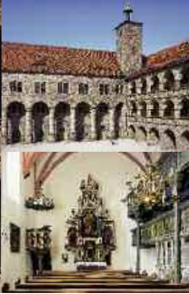
»Schöner Hof« (top l.); Christiansportal on the High Bastion (r.); Castle Church (bottom l.); Mythical beast from the »Schöner Hof« (below)